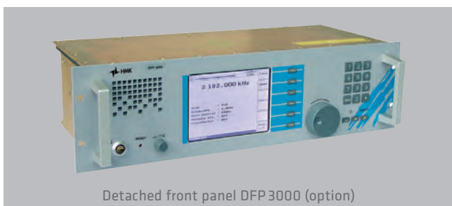
Detached front panel DFP 3000 (option)