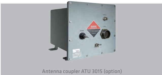
Antenna coupler ATU 3015 (option)