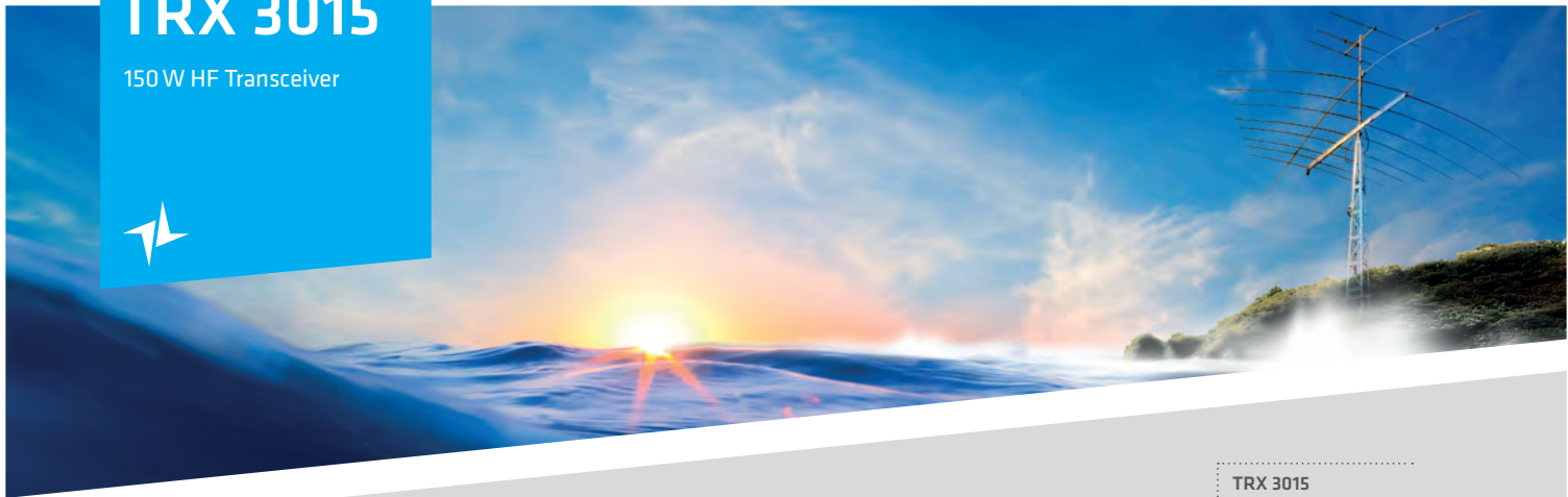
TRX 3015 with optional 19" rack