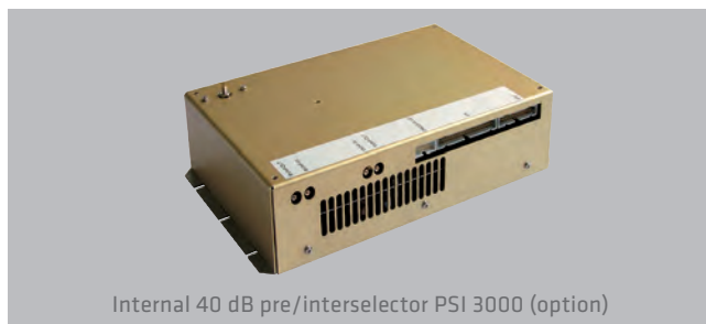
Internal 40 dB pre/interselector PSI 3000 (option)