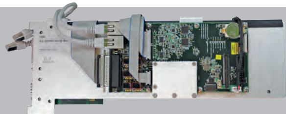
Built-in modem MDM 3003 (option)

Hagenuk Marinekommunikation GmbH Hamburger Chaussee 25 24220 Flintbek | Germany