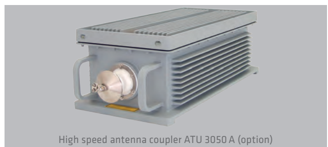
High speed antenna coupler ATU 3050 A (option)