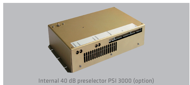
Internal 40 dB preselector PSI 3000 (option)