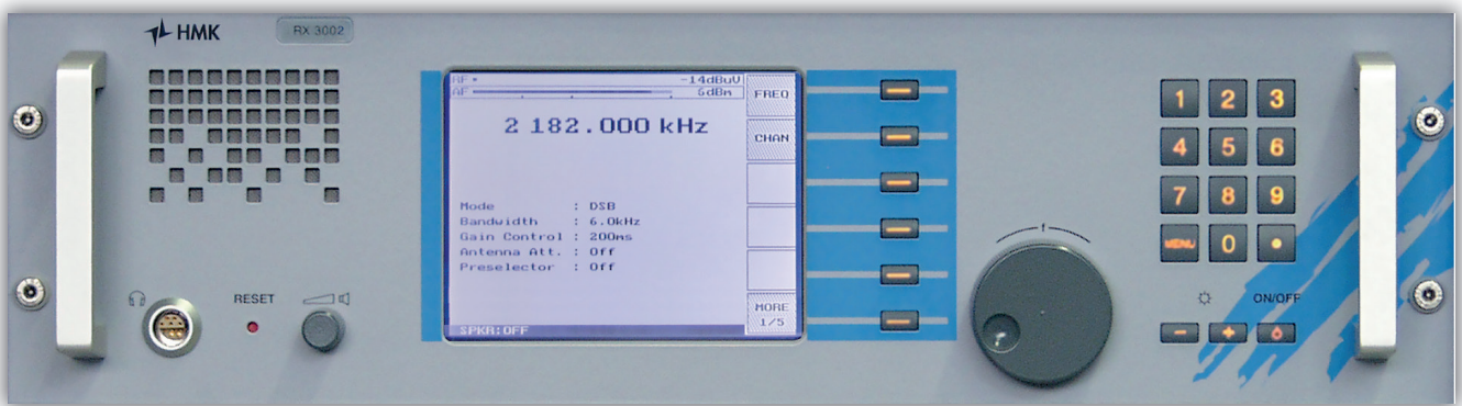
RX 3002 front view

The RX 3002 is designed for voice and data reception and contains the complete receiver unit with built-in AC power supply (additional DC input optional) and reserves space for built-in options such as a preselector and / or multifunction data modem.