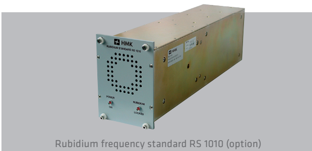
Rubidium frequency standard RS 1010 (option)